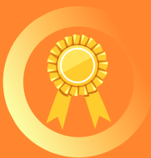
Best Coordinator Award

The winner will be invited to participate in Excursion / Learning Expedition which are organized in different parts of the Country