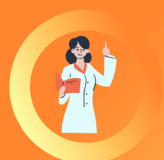
Appreciations Certificate for Teachers