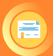
Participation Certificate for All