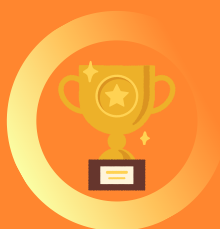
Best School Award