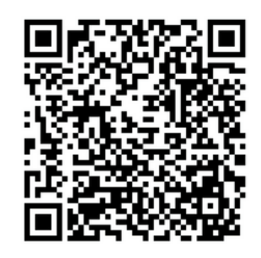
Visit the <u>contest page</u> to see the full guidelines and submit.