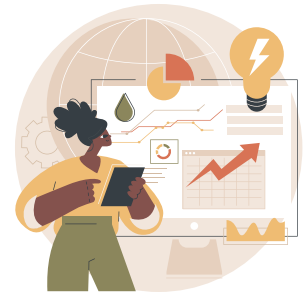
21ST CENTURY SKILLS