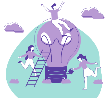
Collaboration & Team work