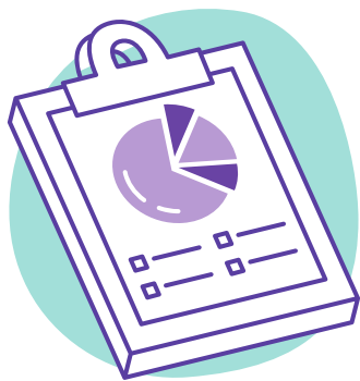
Assignments & Case studies