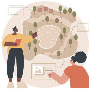
PEER TO PEER LEARNING

Student teams work closely with Mentors from different sectors to design and pilot their solutions. Student's reports, stories, and campaigns will be supported by the Climate community.