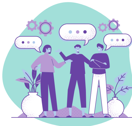
Climate Action Community